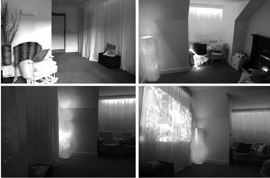
Figure 4 Finished sensory space in different lighting situations.