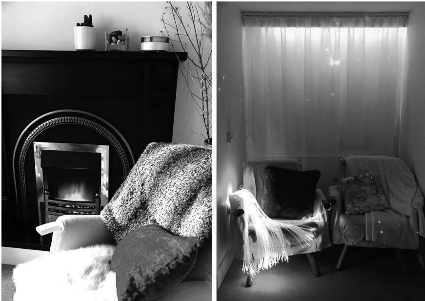
Figure 5 Seating opportunities referencing home-like atmosphere (left) and featuring fibre optics strands and cushions of varying textures (right).