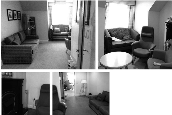
Figure 1 Under-used lounge at Coombe Hill Manor's dementia suite

In line with the collaborative approach, the project started with a participatory workshop (Buur & Matthews, 2008; Sanders & Stappers, 2008) with care-home staff and relatives of residents (Figure 2), which was structured in two parts. First, participants were given the opportunity to learn about and engage in multisensory experiences and activities that stimulating the senses through seeing, touching, hearing, smelling, tasting, and moving. The second part focused on co-designing a space dedicated to sensory activities. During this creative session, participants were invited to consider what items and equipment would be most beneficial for sensory activities with their residents and should be included.